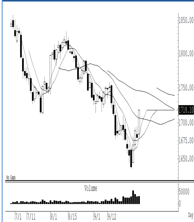
GOZ22 (Close 1,718.10 Chg 38.70)

ราคาทองคำโลกฟื้นตัวดีกว่าคาด สั้น ๆ ไม่ต่ำกว่าแนวรับแถว ๆ 1,675 ดอลลาร์ แนะนำ trading ในกรอบระหว่าง 1,675-1,720 ดอลลาร์ ระวังกำไร ในกรณีที่ปิดต่ำกว่าระดับ 1,655 ดอลลาร์ แนะนำ ถือ short หวังผลปรับตัวลงไปแถว ๆ 1,610 ดอลลาร์ ระวังกำไร